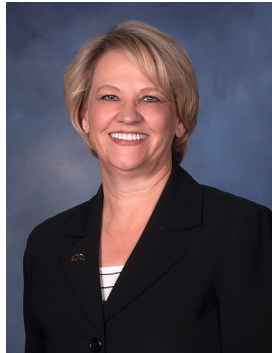
Mayor Debbie Winn

4th of July Activities— Our week-long Celebration! Page 8